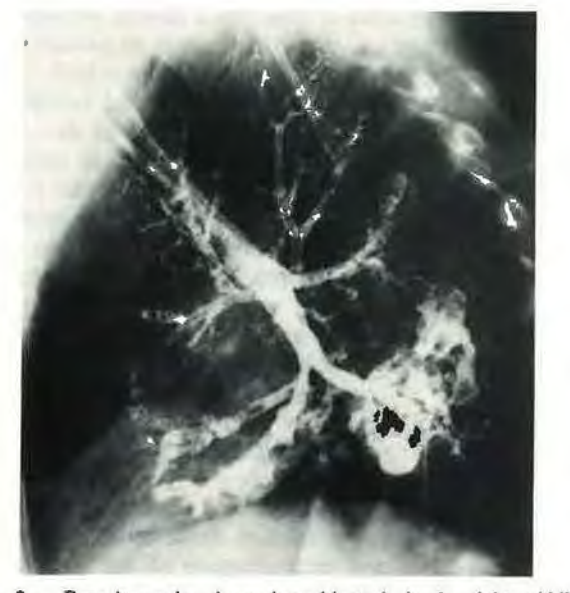
Fig. 2. - Bronchography shows bronchiectasis in the right middle and lower lobe together with a posteriorly located irregular cavity which is in connection with the dilated bronchi.