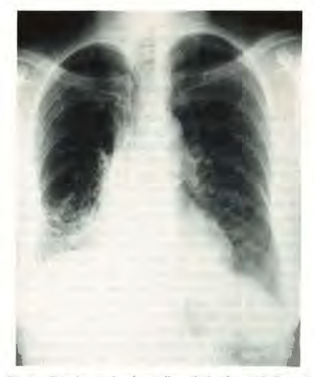
Fig. 1. - Posterior-anterior chest radiograph showing, at the base of the right lung, a volume loss, ill-defined opacity and tubular condensations concomitant with bronchiectasis.

right lower pulmonary artery (fig. 4d). Right heart catheterization indicated that the pressure in the main pulmonary artery was within the normal range.