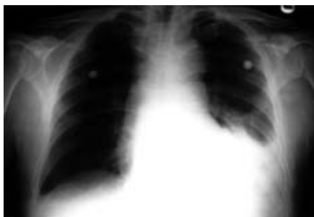
Fig. 1. - Chest radiograph on admission to hospital. Anteroposterior view, with the patient in semi-recumbent position.

On examination, he was pyrexial (38.5°C) and anaemic. Cardiovascular examination was unremarkable, but examination of the chest revealed dullness to percussion at the left base, reduced breath sounds, and decreased vocal resonance. A chest radiograph on admission is presented in figure 1. Investigation revealed a haemoglobin level of 99 g·L -1 with normocytic normochromic indices, leucocyte count 10.0×10 9 cells·L -1 , urea 12.5 mmol·L -1 , and creatinine 168 µmol·L -1 . An initial differential diagnosis of pneumonia, with possible underlying bronchogenic carcinoma or pulmonary embolism, was made. The patient was heparinized and commenced on a broad spectrum penicillin. Initially, his condition improved, with temperature settling and improvement in his dyspnoea and chest pain.