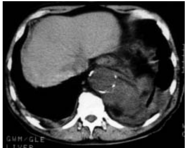
Fig. 3. — Computed tomography (CT) scan of the thorax.

The patient was transferred to his local hospital from his holiday location, where, on review of the history, a diagnosis of left lower pneumonia and parapneumonic effusion was made, with the possibility of an underlying neoplasm. The heparin was discontinued and a pleural aspiration performed. This revealed a bloodstained effusion with a protein level of 42 \text{ g}\cdot\text{L}^{-1} , but no malignant cells were identified. The patient remained stable with only minor pleuritic chest discomfort and, in view of his smoking history, presumptive lower lobe pneumonia and nondiagnostic pleural aspiration, bronchoscopy was arranged. At bronchoscopy, no focal endobronchial abnormality was identified; however, it was noted that the mucosa was oedematous and had diffuse linear streaks of submucosal blood from the level of the main carina, which became confluent at segmental and subsegmental level (fig. 2). No vessels were identified. In view of this rather strange appearance, an urgent computed tomography (CT) scan of the thorax was performed (fig. 3).