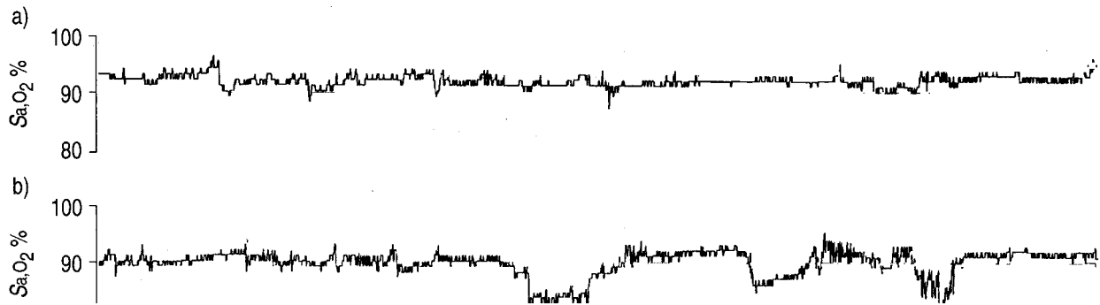
Fig. 2.—Examples of the two patterns of full-night oximetry from the 2 groups of patients: a) is representative of recordings of non-desaturator patients and b) is representative of desaturator patients.

the supine position during the 30 min preceding the onset of sleep. The mean nocturnal S_{a,O_2} and tS_{a,O_2} < 90\% were calculated by computer software.