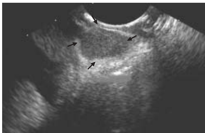
FIGURE 3. Image of a subcarinal lymph node (delineated by arrows) identified on endoscopic ultrasound in a patient with non-small cell lung cancer.