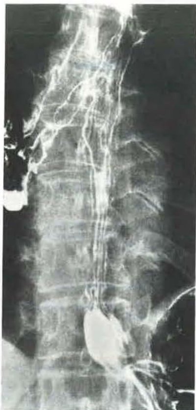
Fig. 2. - Radiograph of oesophagus.