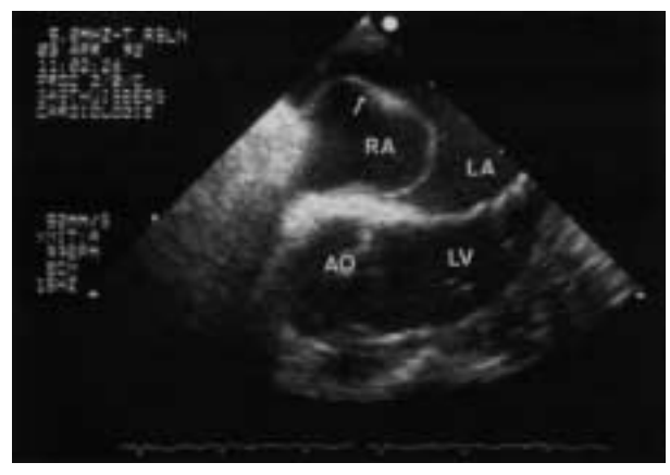
Fig. 2. — Transoesophageal echocardiographic view showing the cavities of the left atrium, (LA) left ventricle, (LV) right atrium, (RA) and aorta, (Ao). An aneurysm of the interatrial septum is bulging into the left atrium (arrow).

At surgery, an aneurysm of the fossa ovalis with two small perforations was found. Resection of the aneurysm and closure of the atrial septal defect was performed. After resection, the two small perforations widened substantially during the in vitro reconstruction of the bulging position of the aneurysm. Postoperatively, the platypnoea and orthodeoxia were resolved (table 1) and the patient was discharged in good condition. The physiological shunt through the left lung was postoperatively calculated at 13% in upright and 11% in supine position.