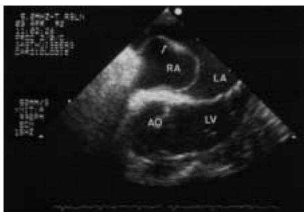
Fig. 2. – Transoesophageal echocardiographic view showing the cavities of the left atrium, (LA) left ventricle, (LV) right atrium, (RA) and aorta, (Ao). An aneurysm of the interatrial septum is bulging into the left atrium (arrow).

At surgery, an aneurysm of the fossa ovalis with two small perforations was found. Resection of the aneurysm and closure of the atrial septal defect was performed. After resection, the two small perforations widened substantially during the in vitro reconstruction of the bulging position of the aneurysm. Postoperatively, the platypnoea and orthodeoxia were resolved (table 1) and the patient was discharged in good condition. The physiological shunt through the left lung was postoperatively calculated at 13% in upright and 11% in supine position.