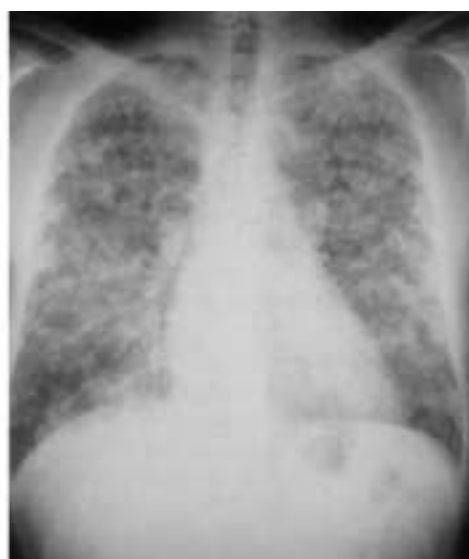
Fig. 1. – a) Chest radiograph, at time of admission, showing cardiac enlargement, right pleural effusion, and bilateral basal linear shadows. b) Chest radiograph, three weeks later, showing cardiac enlargement, bilateral pleural effusion, bilateral nodular infiltrates.