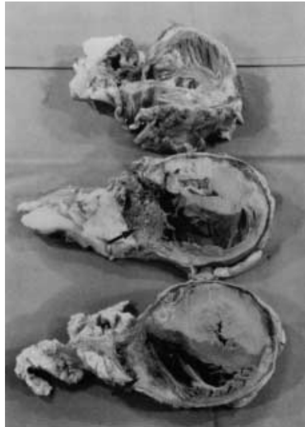
Fig. 3. — Necropsy: heart, horizontal section after formalin fixation, showing tumoral infiltration (—>) of the right atrial and ventricular wall.

cavities. Several small neoplastic emboli were detected by microscopic examination. Two metastases were present in the liver.